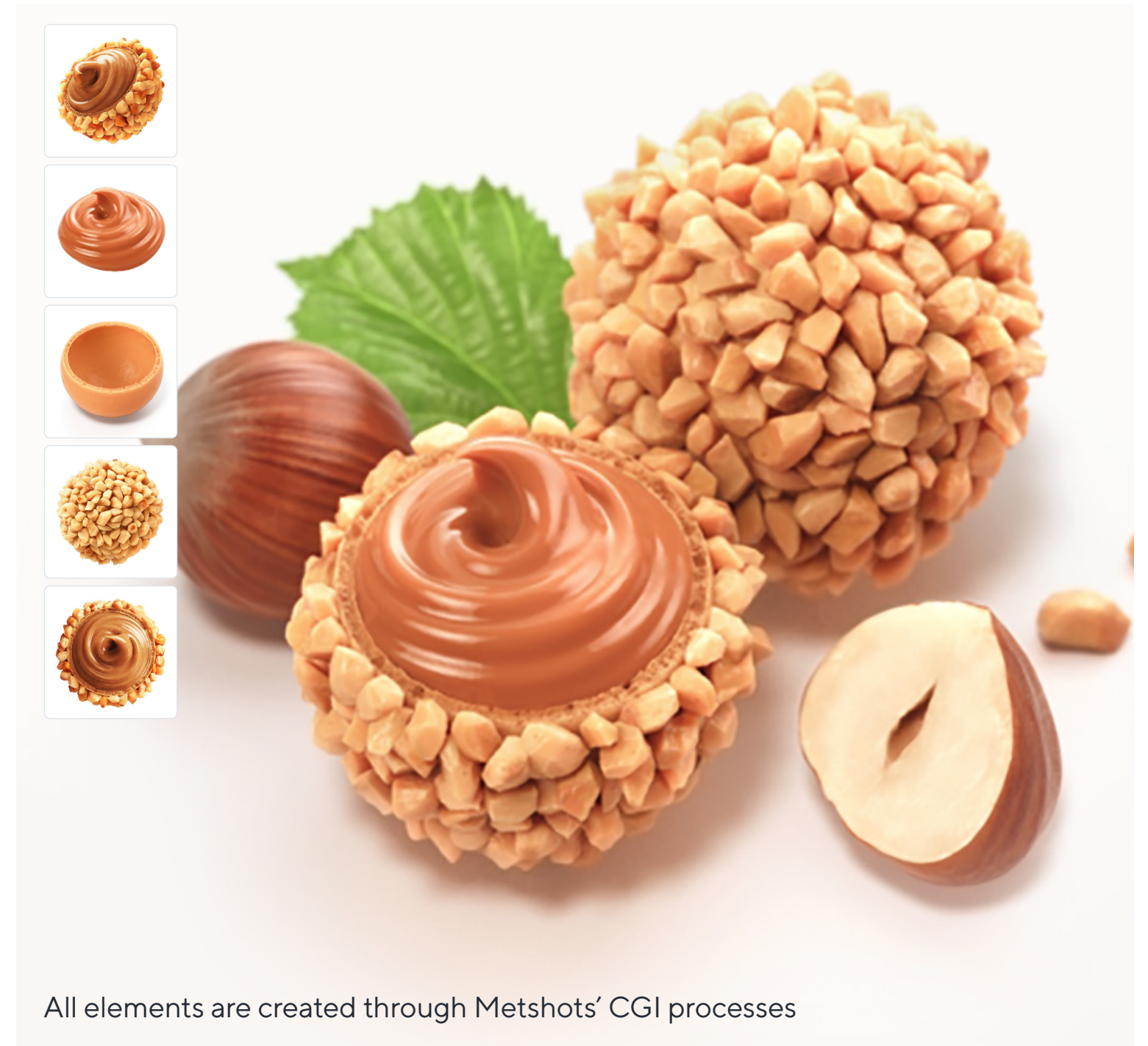
All elements are created through Metashots' CGI processes